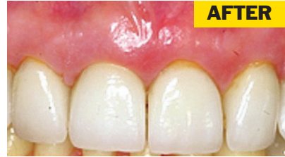
AFTER New technique repairs gums quickly with great results

A DENTAL breakthrough can correct receding gums without painful cutting and stitches – or the need to take time off from work for a recovery.