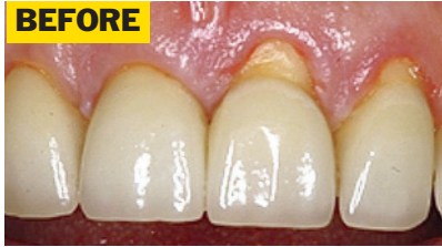
BEFORE Receding gums can cause a slew of problems